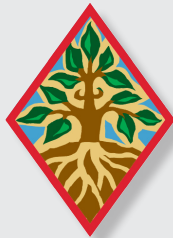
Cadette Trees Badge