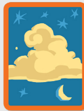
Senior Sky Badge