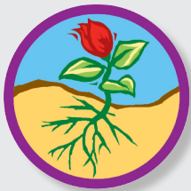
Junior Flowers Badge

Tip for Leaders and Families: You can purchase badges individually, or leaders can place a troop order to celebrate all the Girl Scouts at once.