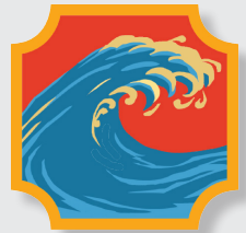
Ambassador Water Badge