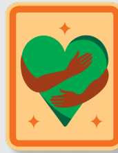
Mind, Body, Me Badge