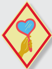
Outside the Mirror Badge