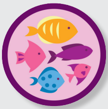
Uniquely Us Badge

Tip for Leaders and Families: You can purchase badges individually, or leaders can place a troop order to celebrate all the Girl Scouts at once.