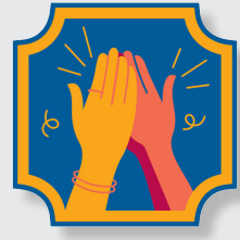
Cheers for Every Body Badge